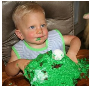
Therapies take many different forms

This guide is a dynamic resource and the details included are correct at the time of publication. However, if you should find any new sources of funding that we haven't included, please contact Unique to tell us about them. We are always pleased to receive new information that we can pass on to carers of children with rare chromosome or gene disorders.