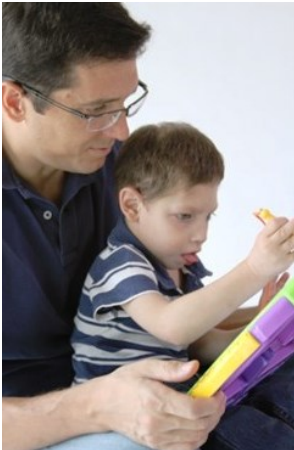
Help can be for everyday items

undertake means testing). Often funders are registered charities and receive lots of different applications, so they may well have quite long waiting lists. You could wait some time for a decision about funding of an item, so if it is urgent.... speak to them!